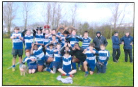
Table toppers: Wanstead Under-14s.

THERE was delight and disappointment for Wanstead following their Under-14 and Under-15 matches at the weekend. The Under-14s cemented their place at the top of the league with a 22-19 victory over Basildon, but the relegation of the older age group was confirmed by a 27-15 loss to Upper Clapton.